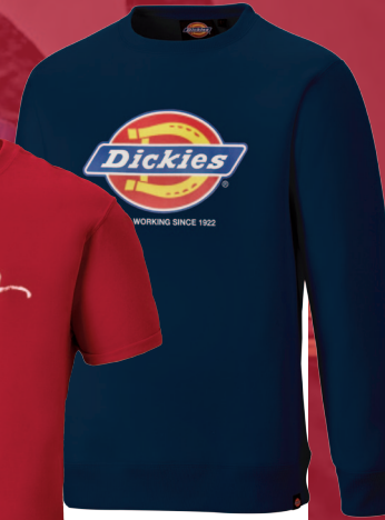
Dickies' 1922 range harkens back to looks from the company's storied history

This month we're giving three lucky readers a Hanston t-shirt and Longton sweatshirt from Dickies' new Hard Working Since 1922 range.